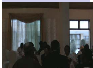
Participants at one of the Dinners held during the airlift