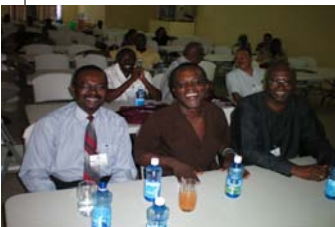
The Nigerian Team with the Former Prime Minister of Grenada Dr Keith Mitchell

All across the Caribbeans the Leaders as a result of the meetings pledged not only to grow the work in their areas but also to ensure the growth of the work in the currently uncovered areas