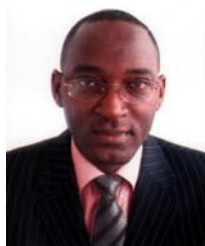
Hon Justice Obisike Oji South East