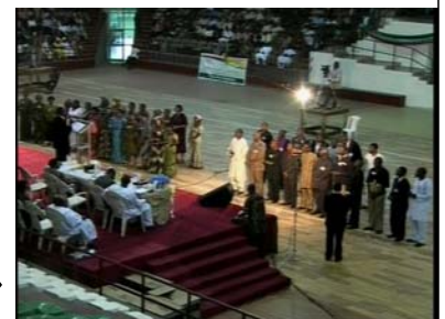
Life members for decoration →