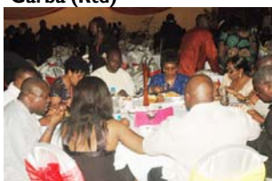
Cross section of audience at the occasion