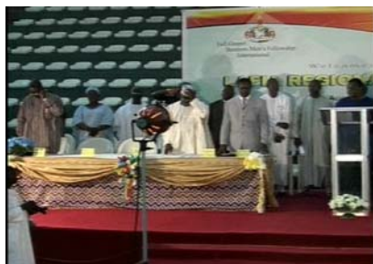
Opening Ceremony: The Deputy Governor is standing beside the National President