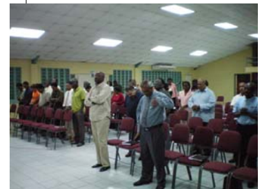
Delegates at the Grenada