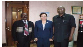
The Nigerian Delegation with Hon Mme. Justice Rajnauth-Lee (High Court, Trinidad)